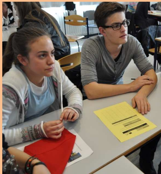
Students preparing their list of values in the final session of Copenhagen Workshops (April 2012)